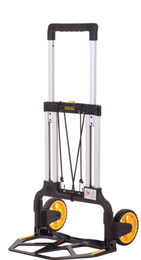
FXWT-707: Adjustable Grip